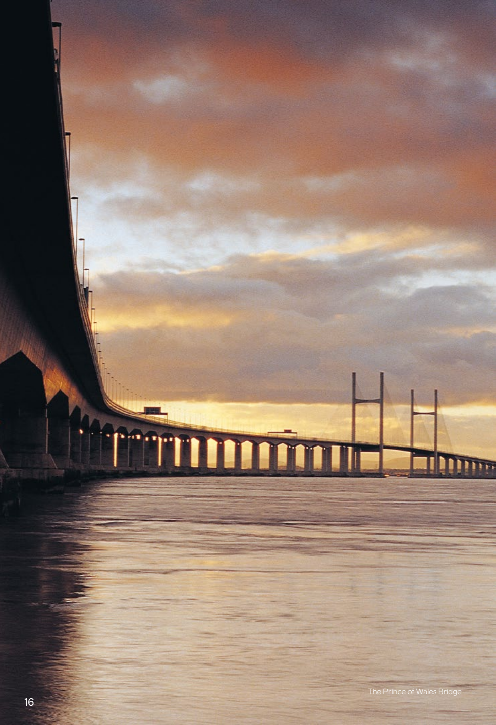
The Prince of Wales Bridge