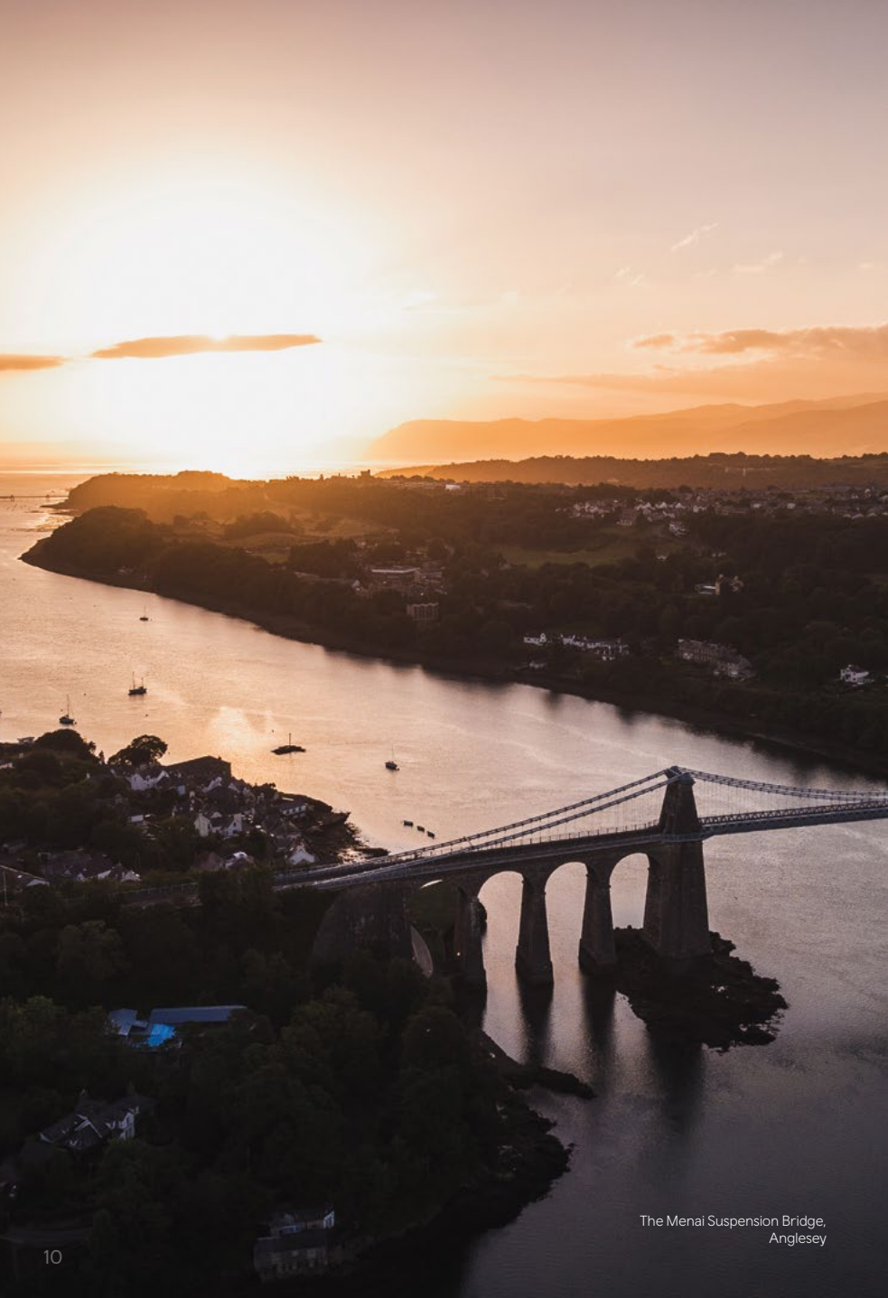
The Menai Suspension Bridge, Anglesey