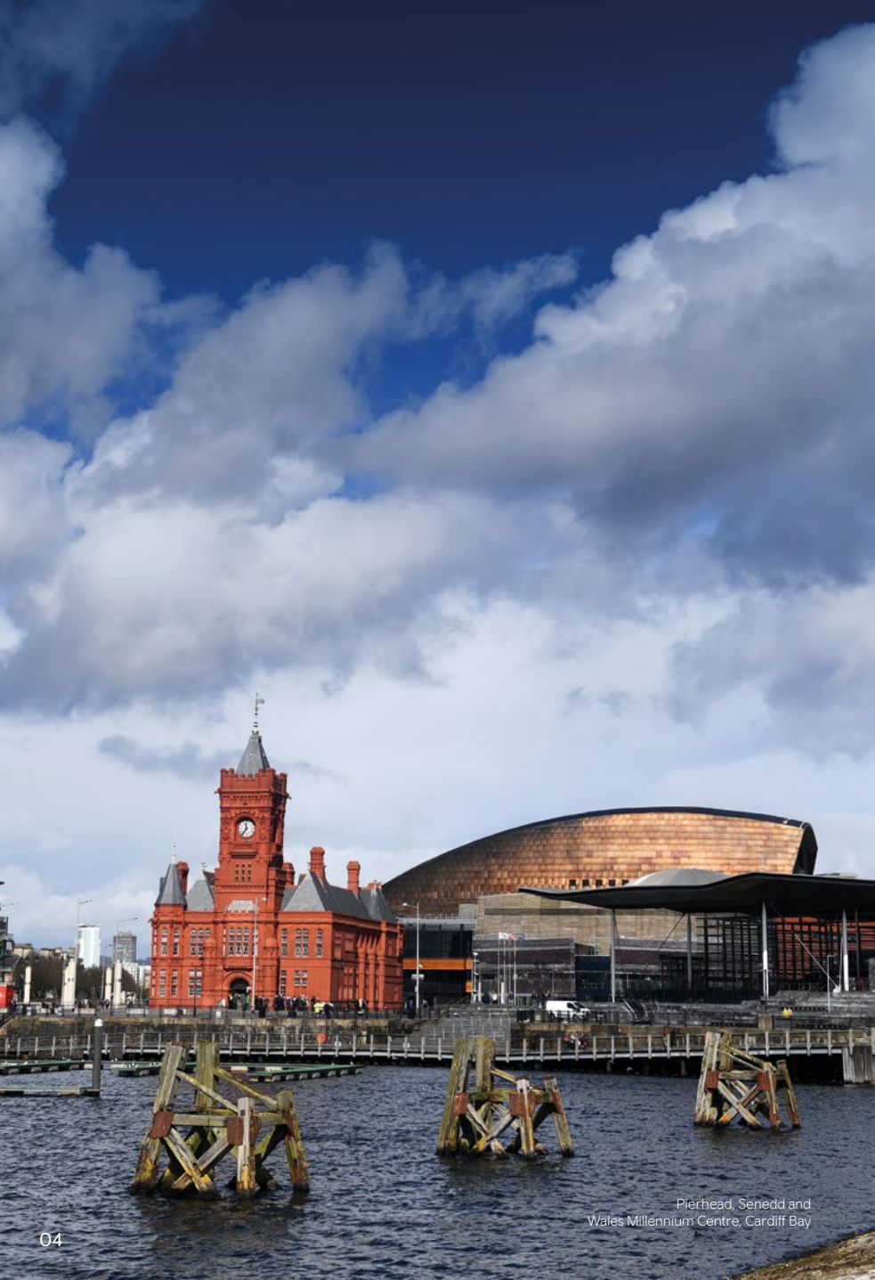
Pierhead, Senedd and Wales Millennium Centre, Cardiff Bay