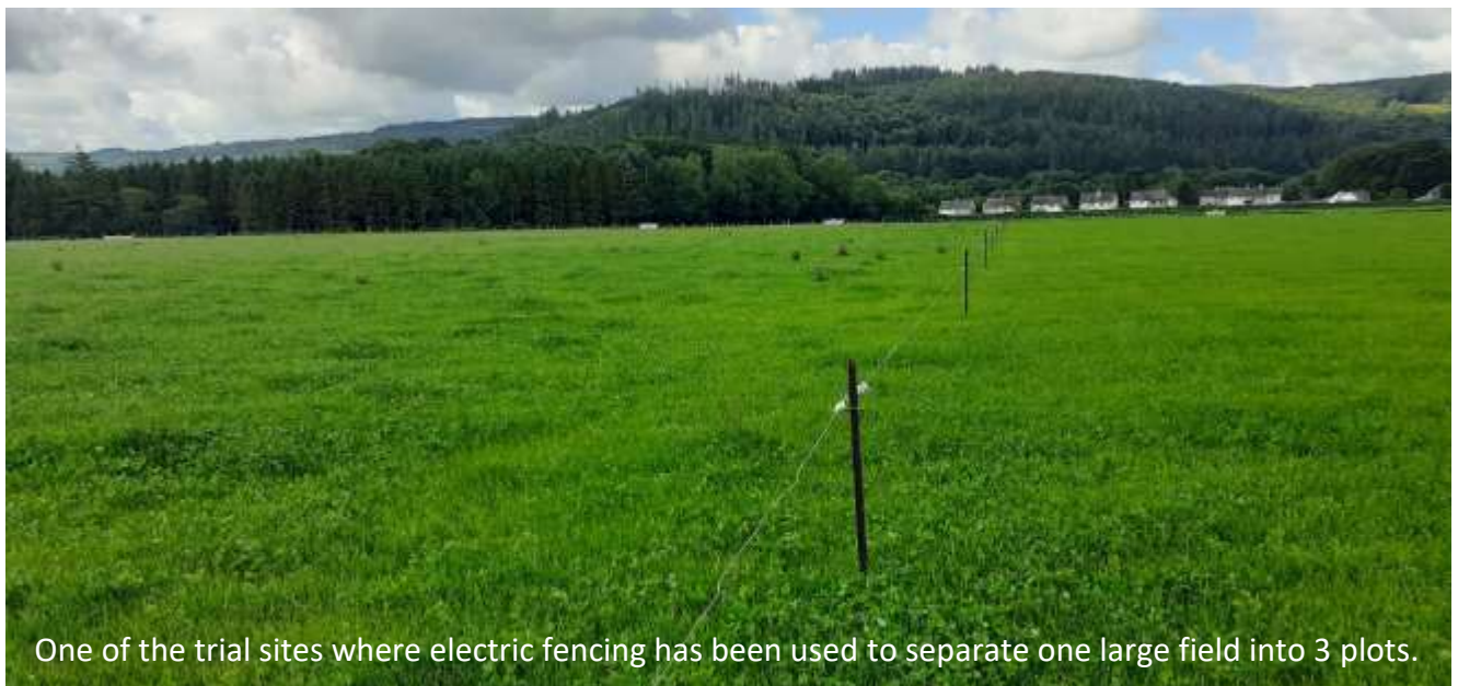
One of the trial sites where electric fencing has been used to separate one large field into 3 plots.

By the end of June, the conventional plots have had a total of 80 kgN/ha-120 kgN/ha, whereas the foliar feed plots have had 27 kgN/ha- 45 kgN/ha. It is important to remember that the foliar feed plots on average have received 84 kg/ha less nitrogen than the conventional plots whilst still producing very similar amounts of grass. By comparing the fresh grass samples and the plate meter readings from the silage site to date, it seems to show a consistent trend that the foliar feed plot grass has a higher dry matter content than the conventional by 4.5%-5%. This in turn would mean we need to increase the dry matter yield data for the foliar feed plots by 4.5%-5%, which would close the gap between the foliar and conventional plots. We will know more by the end of the season as to the validity of this trend.