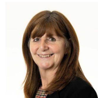
Lesley Griffiths MS Minister for Rural Affairs and North Wales, and Trefnydd

Together we achieved – and exceeded – that goal.