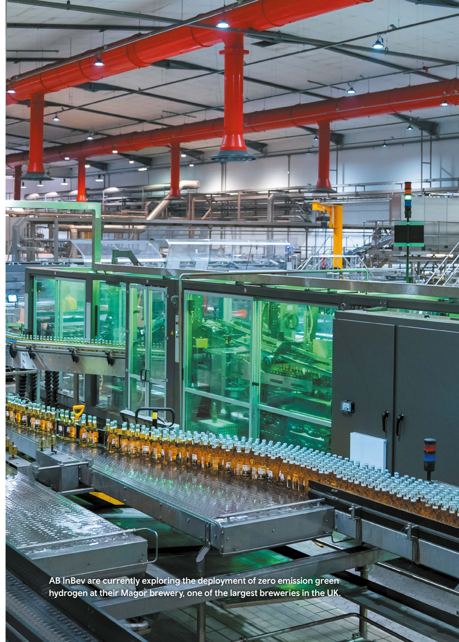
AB InBev are currently exploring the deployment of zero emission green hydrogen at their Magor brewery, one of the largest breweries in the UK.