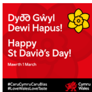
Generic digital advert

Digital assets for static posts on Facebook, Instagram, Twitter (X), and LinkedIn