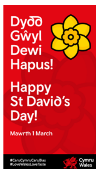
Generic advert for Stories / Reels on Facebook and Instagram.