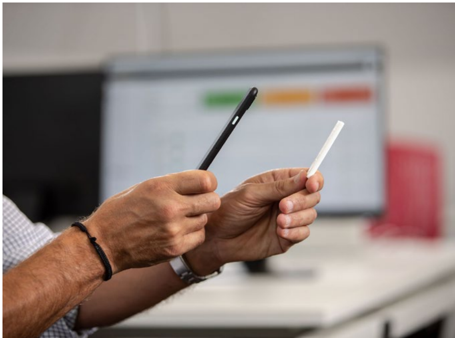
Quickly capture lateral flow test results with Transform®.

Wales’ reputation as a hub for Life Sciences has been steadily growing in recent years, with innovative Welsh businesses playing a vital role in tackling the coronavirus pandemic. Welsh Government investment is helping other businesses like Bond Digital Health to develop solutions to the challenges that the Covid19 pandemic has created and also supporting the sustainable growth of cutting edge start-ups.