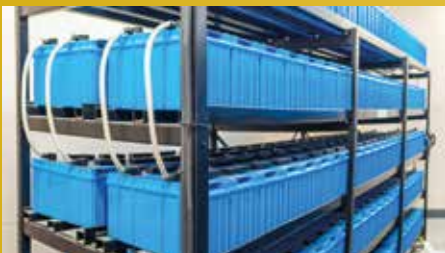
Example of standby batteries

S tandby batteries are widely used across industry to provide power when the mains electricity fails. Although they may seem rather low tech, they are used in high tech industries such as computer data centres to keep the internet running and even in power stations to keep the control and monitoring system running when the grid fails.