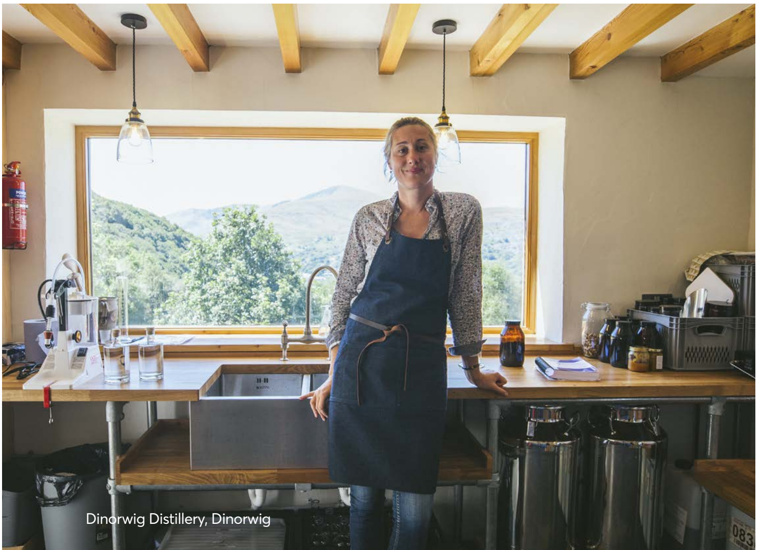
Dinorwig Distillery, Dinorwig