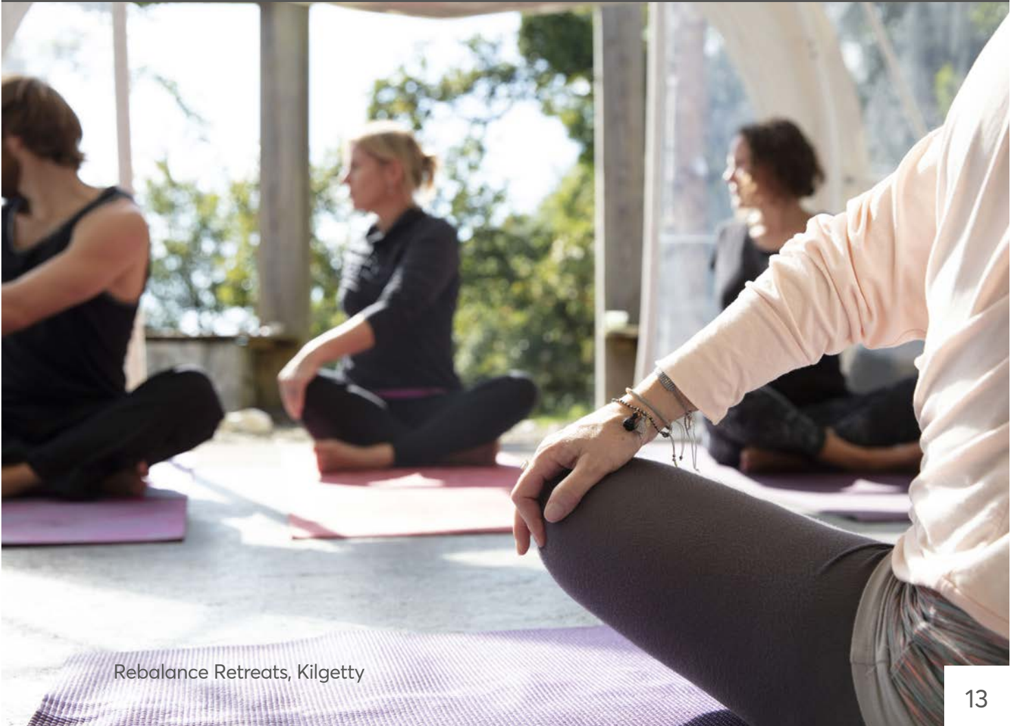
Rebalance Retreats, Kilgetty