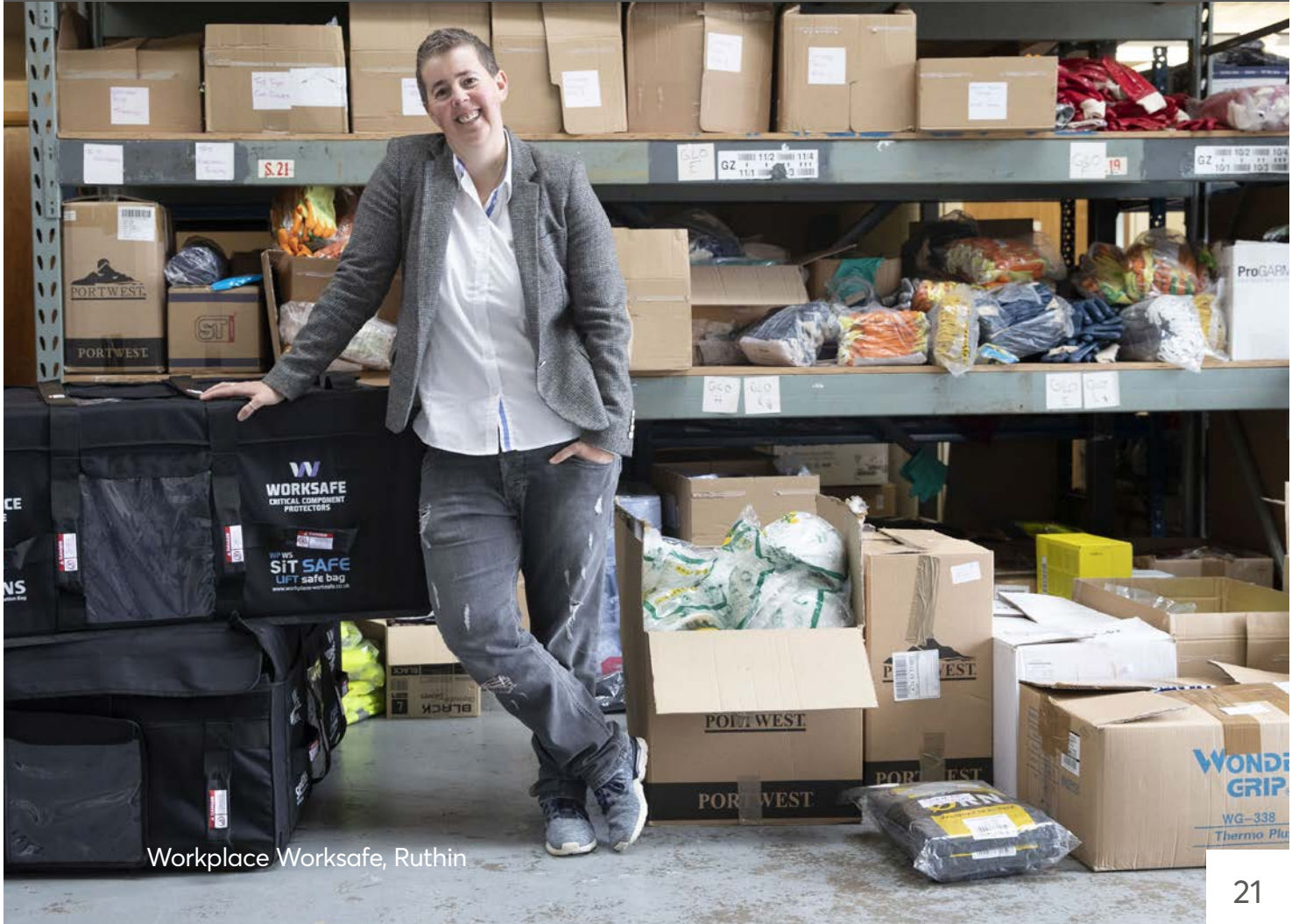
Workplace Worksafe, Ruthin