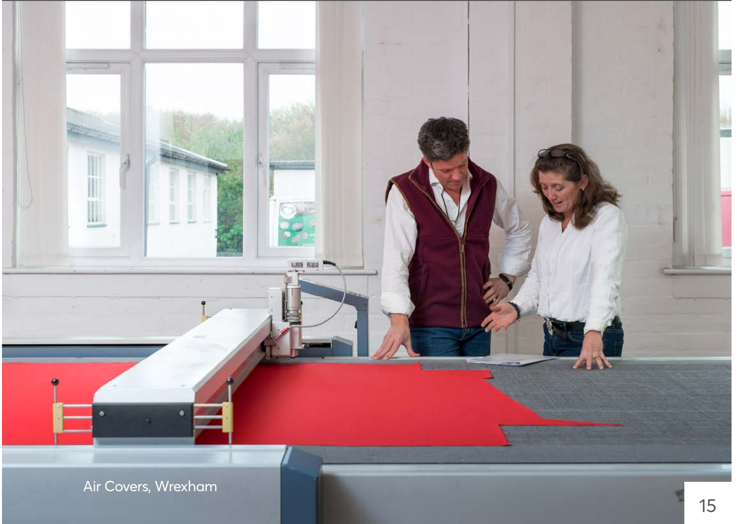
Air Covers, Wrexham