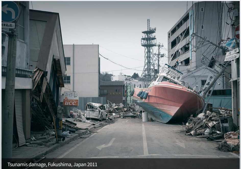
Tsunamis damage, Fukushima, Japan 2011