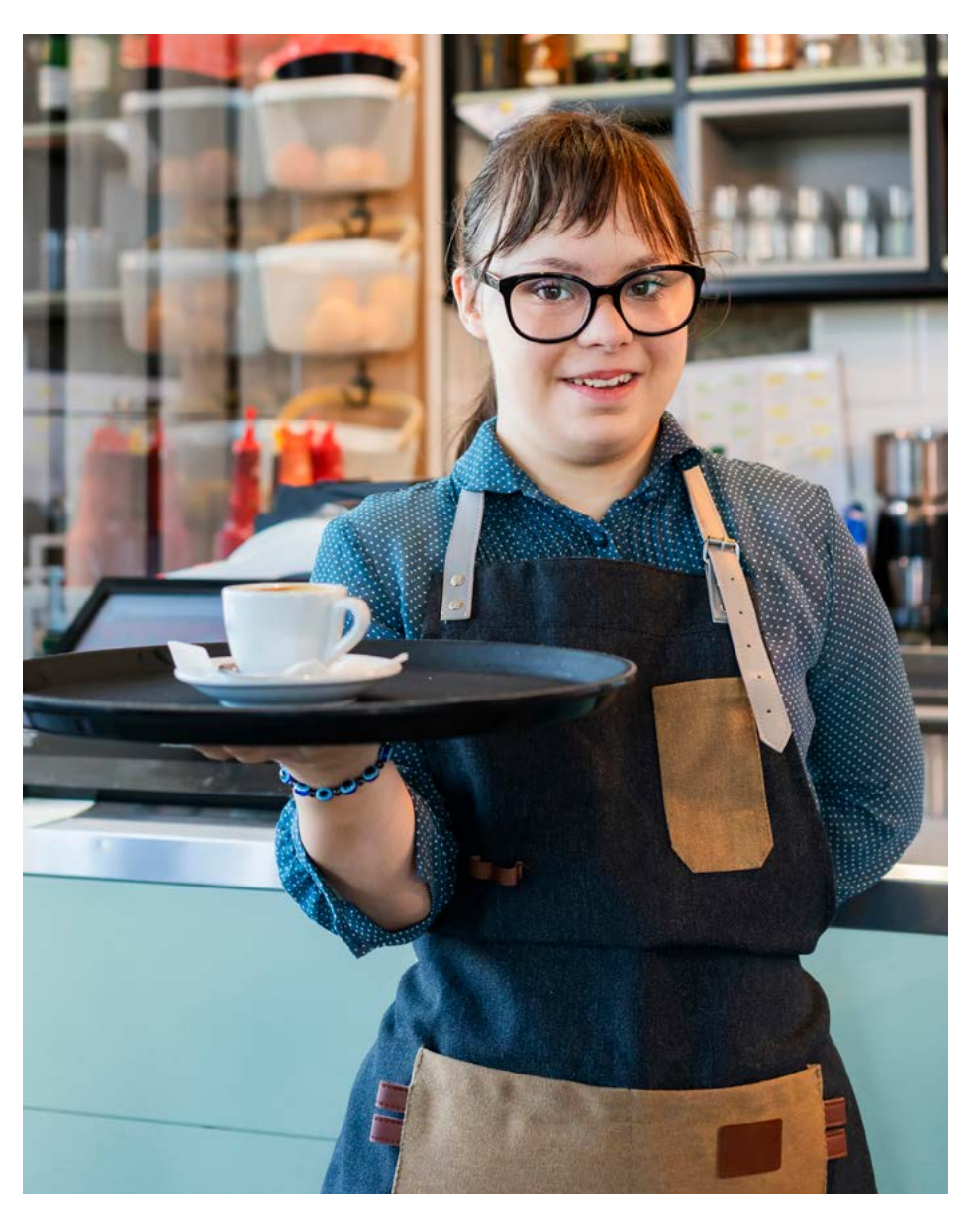
Published June 2023