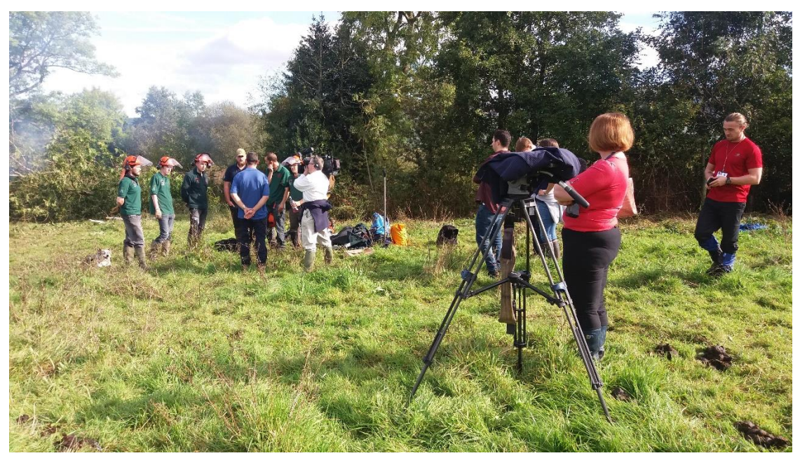
Filming with ITV news

participate. Others valued being able to keep their existing part time work while still participating. A smaller number were clear that they would have preferred to be employed fulltime, even if only for a few months. Some typical feedback from trainees is given below. The progression table in 5. above clarifies that the majority of young people, previously NEET or near NEET, progress into employment, apprenticeship or higher education as a result of participating. The Get Into the Brecon Beacons has directly enabled some to move into employment in the land management sector, inspired others to gain qualifications in countryside management and opened up a wider number to a range of employment opportunities and experiences. E.g. Filming with ITV Wales, Meeting HRH The Prince Of Wales and an Artic Expedition.