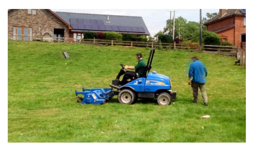
Mower training - Penybont

Emergency First Aid at Work (+ Forestry element) Level 2 Working at Heights Level 2 Manual Handling Lantra Level 2 - Safe Operation of Brushcutter/Trimmer Lantra Level 2 - Ride on Mower Introduction to Dry Stone Walling National Botanic Garden of Wales - Sustainable Garden Design – an introduction to techniques and methods. Lantra Chainsaw Maintenance and Cross Cut Lantra Hedge cutter.