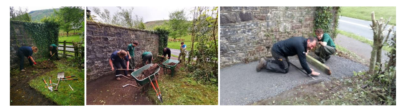
Vegetation Clearance and Path Improvement - Craig Y Nos Country Park - May 2019