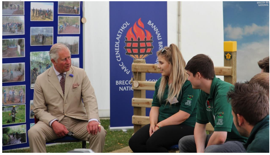
Trainees discussing the project with HRH The Price of Wales - July 2018