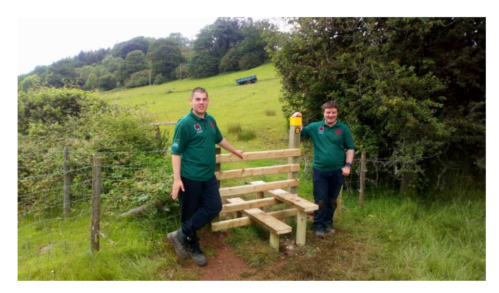
Installing Rights of Way, footpath diversion stile - June 2019