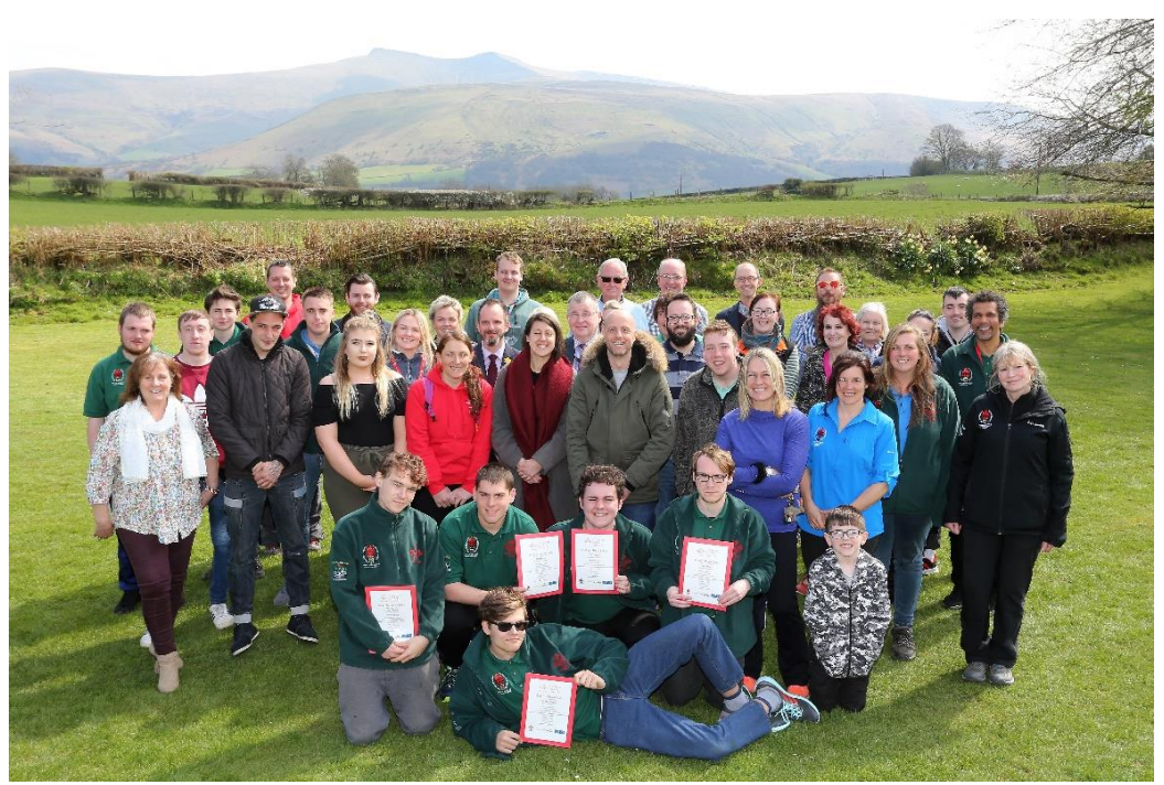
Cohort 4 - end of fortnight celebration event

A range of staff involved in the fortnight all contributed to assessment to identify those young people likely to be able to complete and benefit from the three month traineeship. For those not selected PT staff provided additional support and signposting. Project staff helped with identifying transport and BBNPA made available a hardship funding to help any trainees struggling with the upfront cost of bus fares.