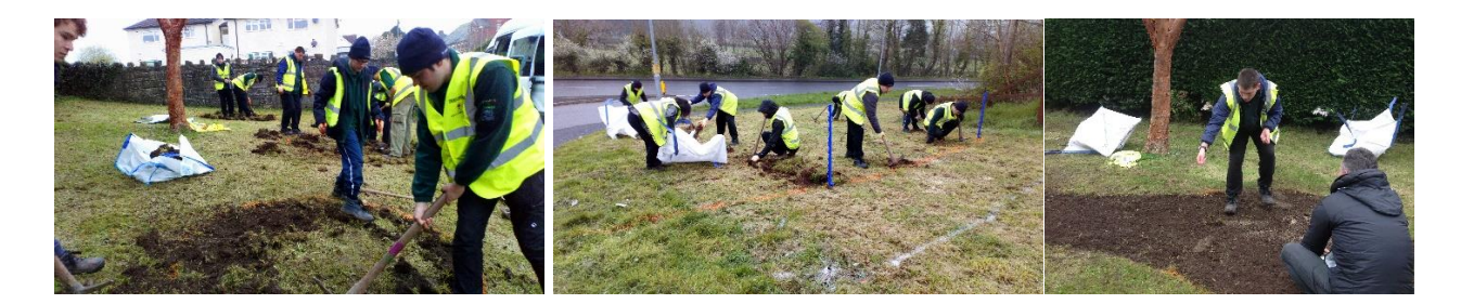
Wildflower planting -- May 2019