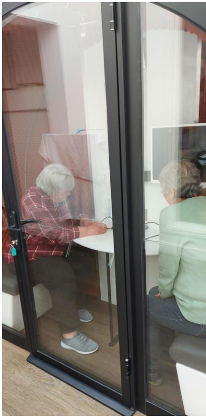
Volunteer advises user in the pod

Joint work between the County Council and the Community Centre We have worked very closely with the County Librarian on the project. She has been able to signpost us to other departments. Her knowledge of the range of services in Powys is very good and she has been able to help us develop the service. As a result, through new funding under the UK Community Renewal Fund, we are jointly developing a Digital Hub in Knighton and have a joint staff member who is assisting people in using technology. We have also had grant funding to develop the garden area outside the library. Powys County Council also funded a small pod /office, because we lacked facilities for private interviewing for the Library or the Community Centre. Although we were not able to use it until recently, it is a very helpful addition to our facilities.