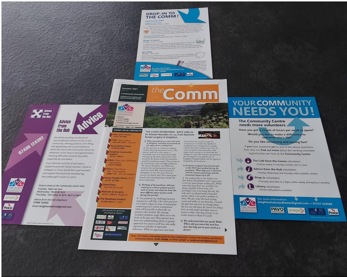
Comm Newsletter plus Hub Info distributed July 2021