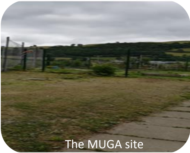
The MUGA site