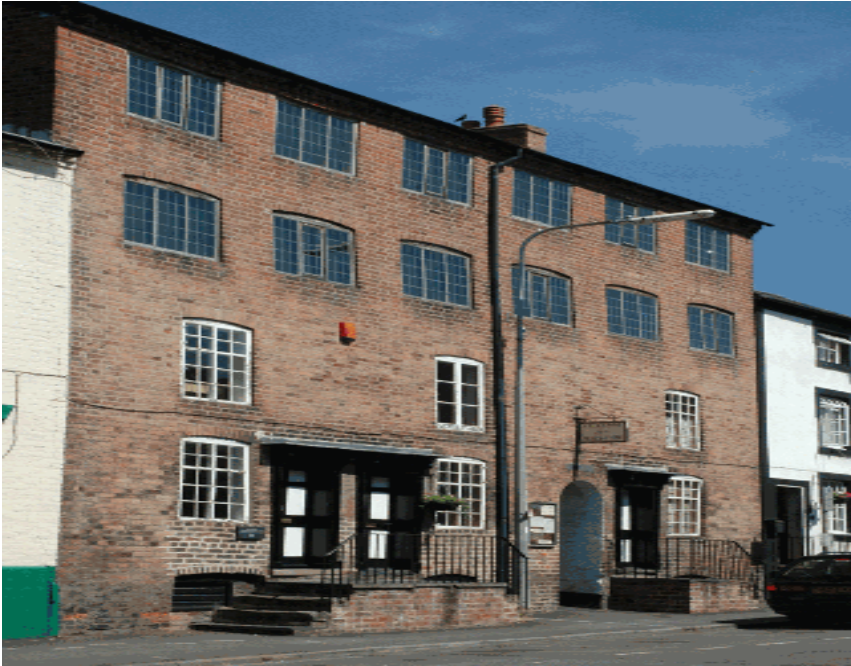
NEWTOWN TEXTILE MUSEUM, COMMERCIAL ST, NEWTOWN SY16 2BL