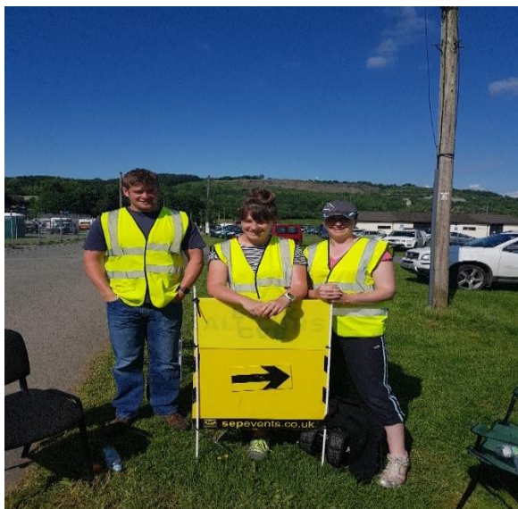
Volunteers from Radnor Ladies Hockey Club enjoying the sunshine whilst on car parking duties

organisation would be paid £5,000 to steward the car park for the week. The contract was awarded to the Radnor Ladies Hockey Club who found out about the stewarding offer through PAVO and the Supporting Communities Project. Thirty members of the club provided a safe and friendly marshalling service in the car parks and the visitor bus drop-off points between 06.30 and 23.00.