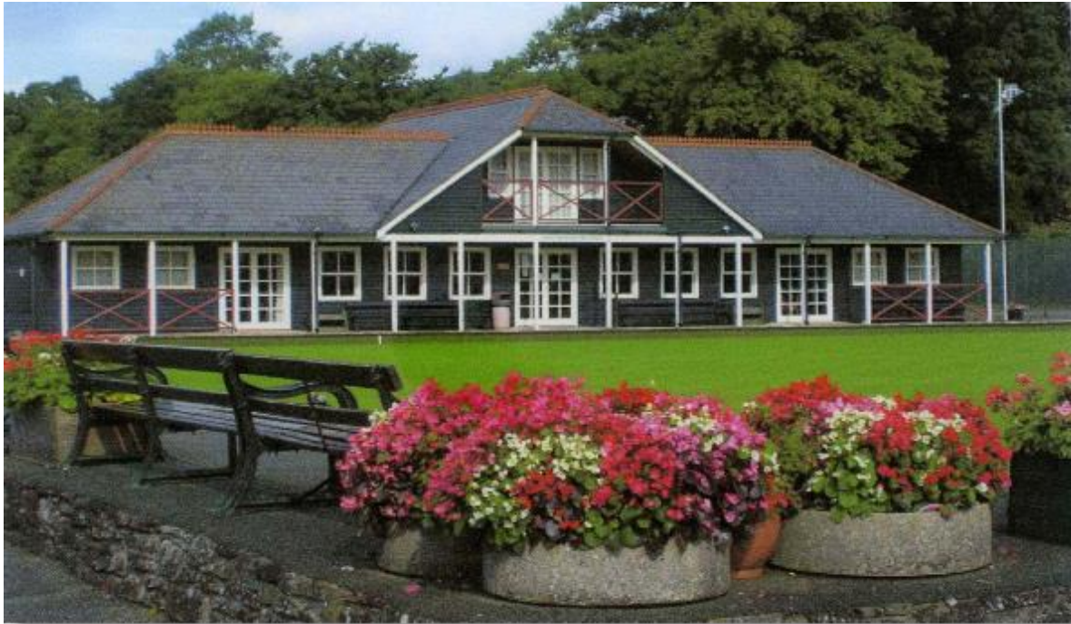
Brecon Bowling Club, The Green, via Kensington, Brecon, Powys, LD3 9BA