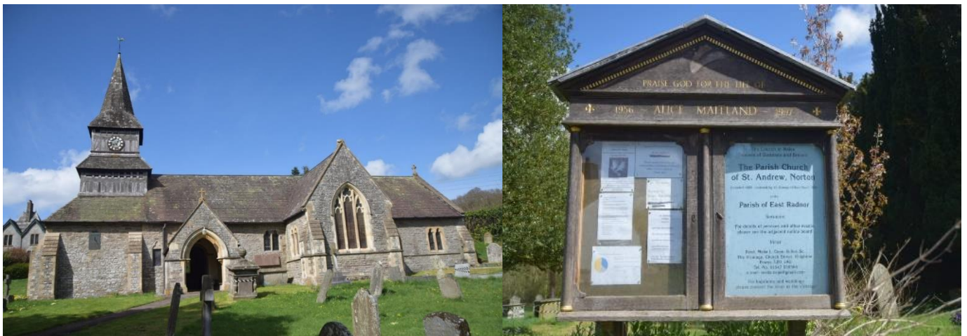
St Andrews Church, Norton

The community in Norton have been exploring the idea of converting part of the church into a community space for 20 years, with one keen resident having plans drawn up, however due to fragmented support the project never came to fruition. A small number of individuals have now come together to revisit developing a community hub for Norton.