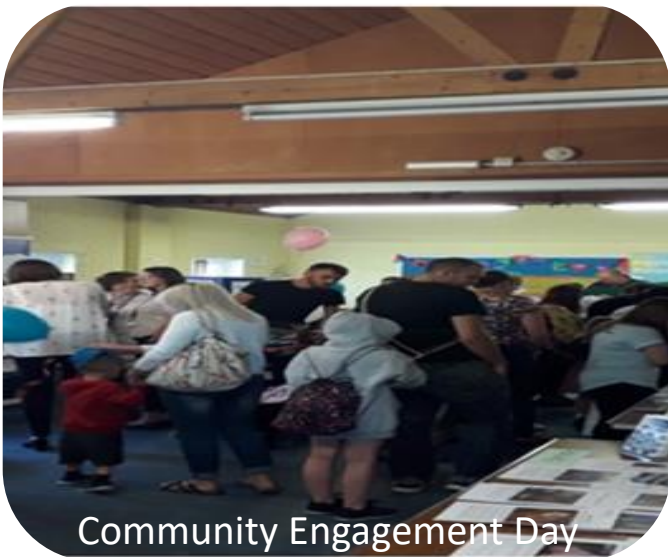
Community Engagement Day