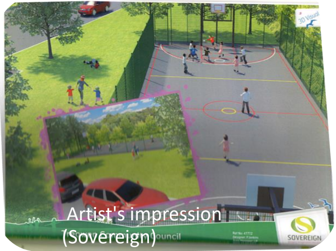
Artist's impression (Sovereign) Council