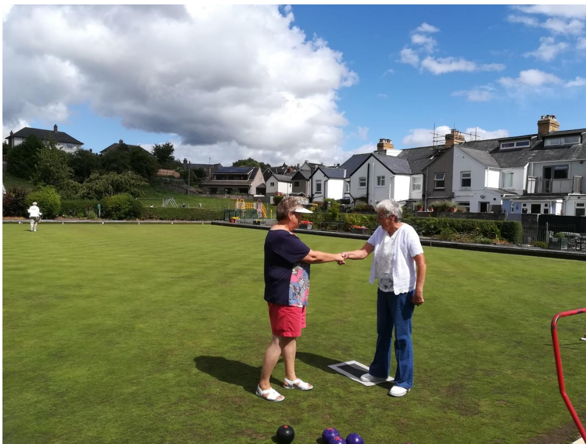
Two regular players enjoying long summer days of fine playing weather

In 2015, the club took over ownership of the club from Powys County Council under a Community Asset Transfer for the token sum of £10.